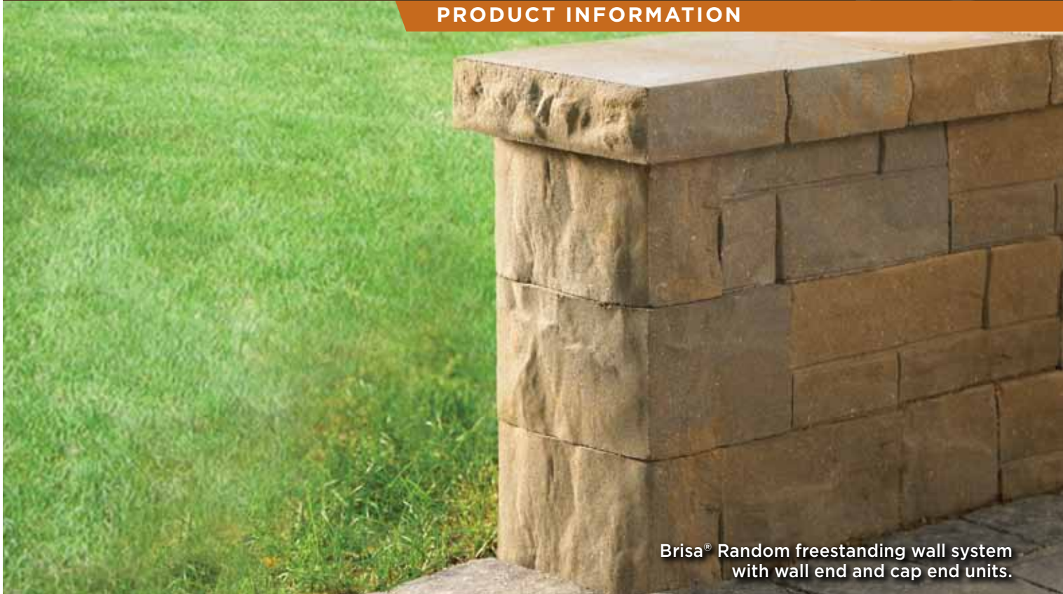
Brisa ® Random freestanding wall system with wall end and cap end units.

New accessories are now available for the Brisa ® wall system, a design inspired by split limestone. Three-sided cap end unit and wall end units save installation time, minimize cutting and improve aesthetics, compared to other options for ending a wall in a multiheight, Random or 6-inch multipiece system.