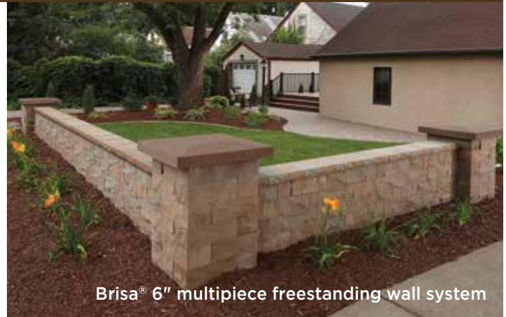
Brisa® 6" multipiece freestanding wall system

* May vary depending on the installation pattern.