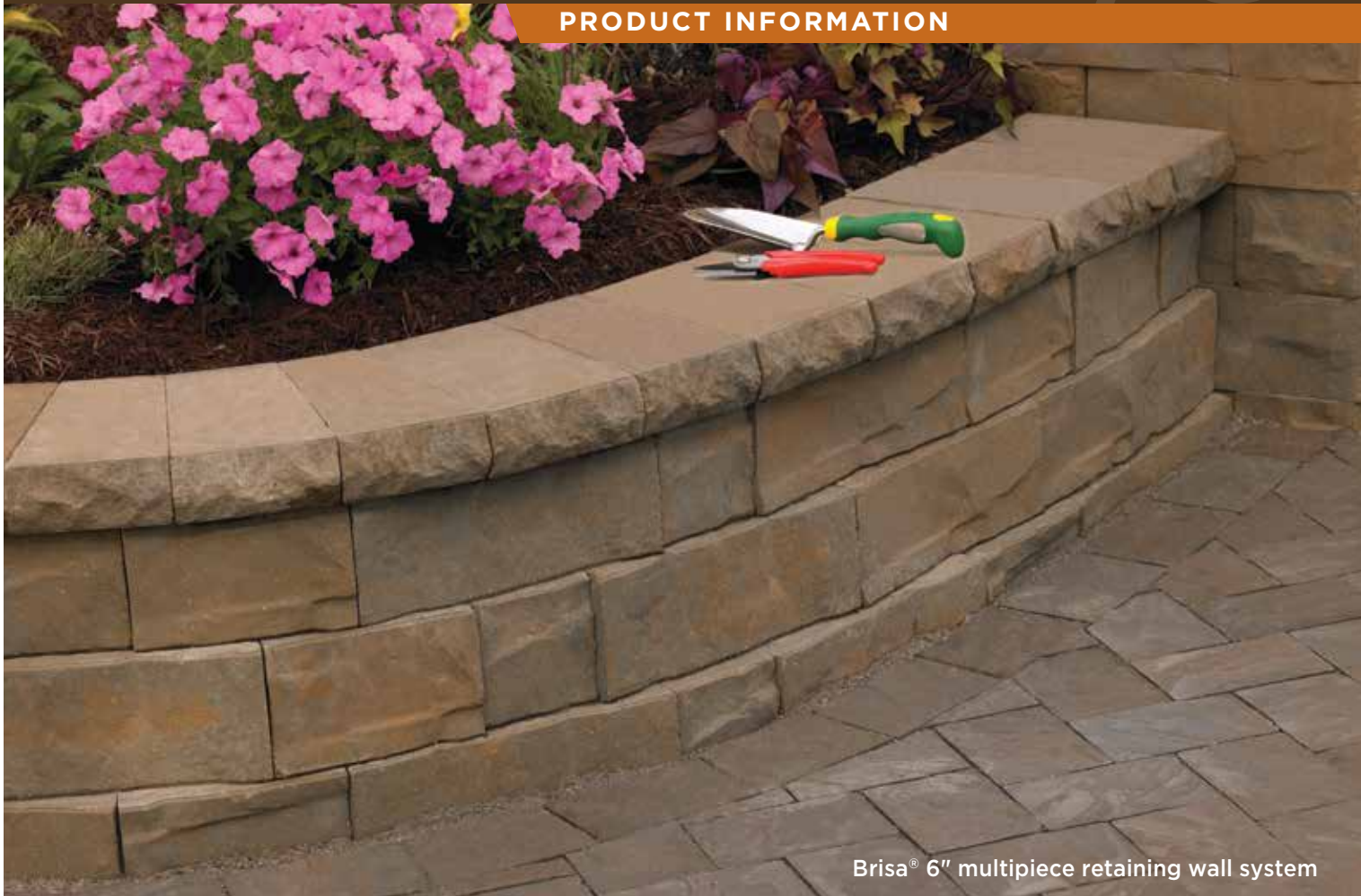
Brisa ® 6" multipiece retaining wall system

Get the look of natural stone with the Brisa ® 6" multipiece wall systems. With a design inspired by split limestone, the Brisa ® 6" multipiece retaining wall system is an attractive alternative to traditional retaining wall blocks. Its elegant design provides remarkable versatility for any outdoor project. Complementary accessories and freestanding wall products complete the system.