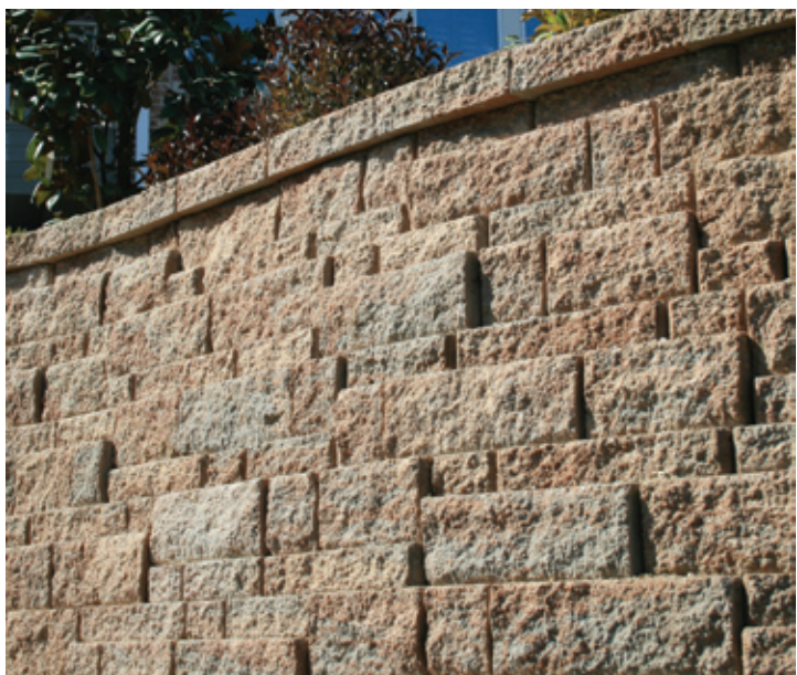
Combine the Highland Stone* 6- and 3-inch wall systems to construct a multiple-height wall with the easy-to-use Sequent<sup>™</sup> panel installation pattern.

**May vary depending on the installation pattern.