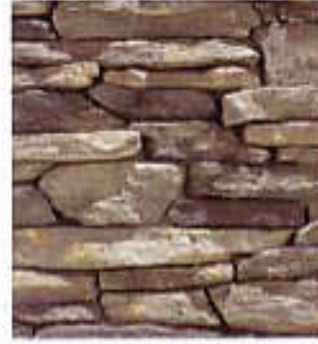
MINERET | Bluffstone