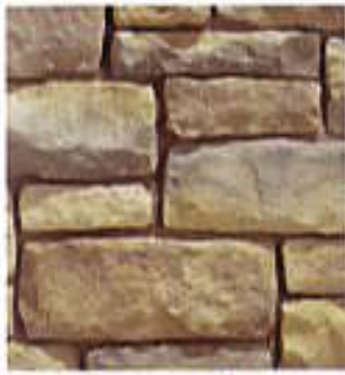
SAN MARINO | Limestone