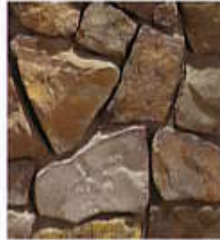
POLERMO | Country Rubble