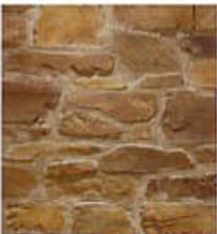
VENETO | Field Ledge