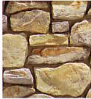
LUCERA | Hillstone