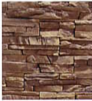
SANTE FE | Stacked Stone