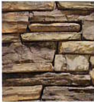
SARATOGA | Rustic Ledge