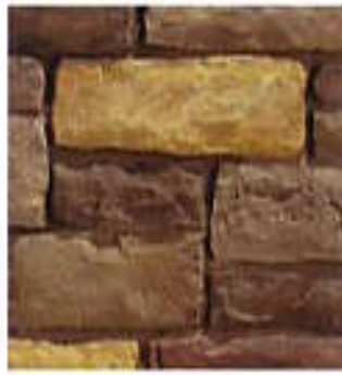
SAVANNAH | Limestone