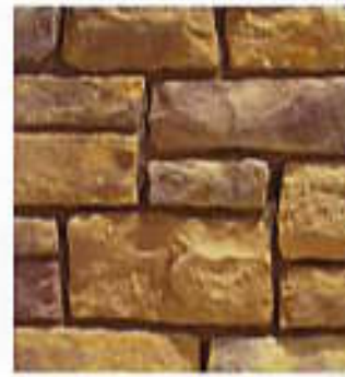
SHILO | Limestone