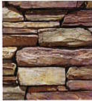
SADDELEBACK | Rustic Ledge