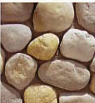
RIO GRANDE | River Rock