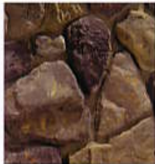
DAROTA | Top Rock