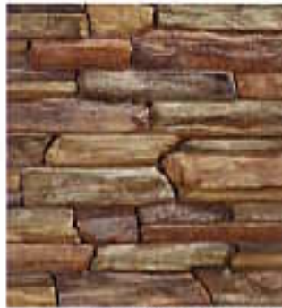
SAWTOTH | Rustic Ledge