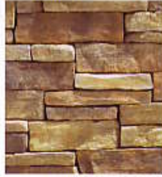
YUKON | Mountain Ledge