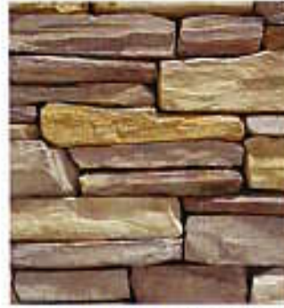
CLEARWATER | Rustic Ledge