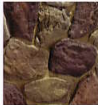
BUCKHORN | Top Rock