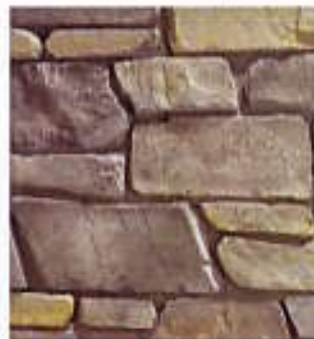
ANDANTE | Field Ledge