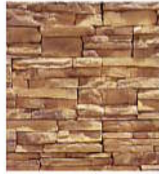
PADOSA SPRINGS | Stacked Stone