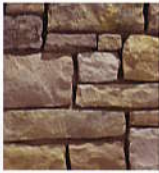
YORK | Limestone