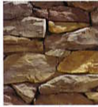
BRONZE | Shadow Rock