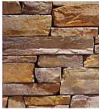
MESQUITE | Cliffstone