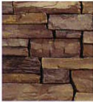
LANTANA | Cliffstone