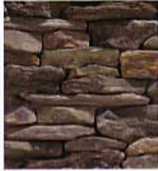
COOB DAY | Bluffstone