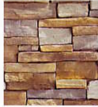
SHASTA | Mountain Ledge