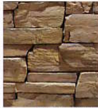
PONDEROSA | Cliffstone