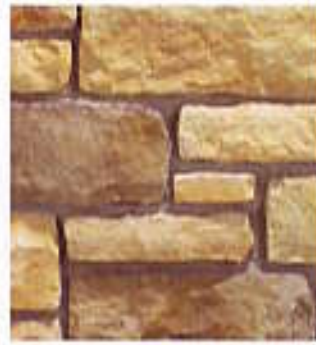
CASTILLO | Limestone