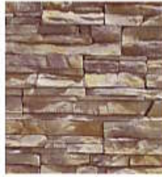
NANTUCKET | Stacked Stone