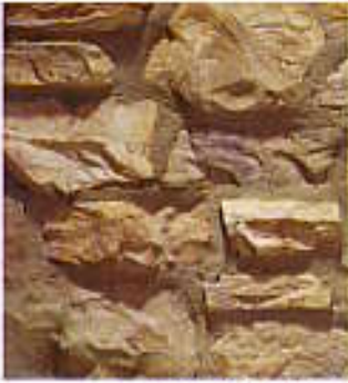
MOLANO | Hillstone