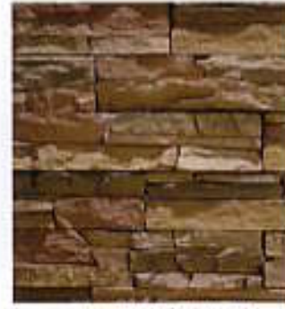
CASTAWAY | Stacked Stone