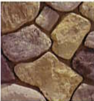
MONTANA | Top Rock