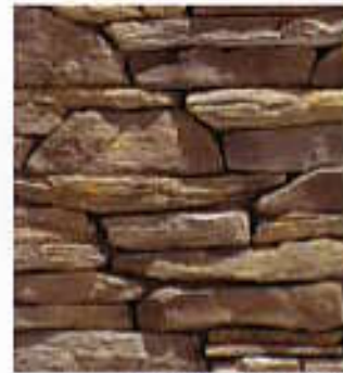
PRESCOTT | Bluffstone