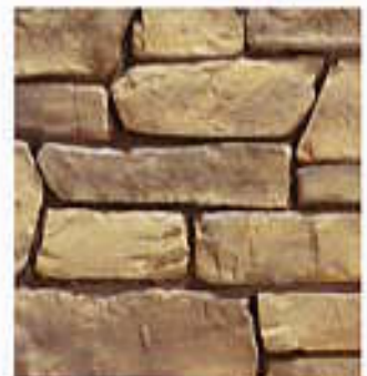
UMBRIA | Field Ledge