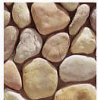
BARNIER | River Rock