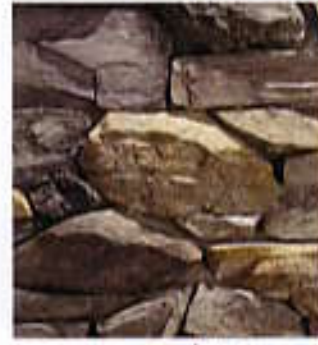
TETON | Shadow Rock