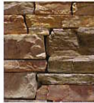
MANZANITA | Cliffstone