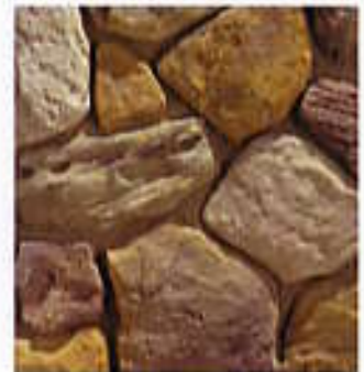
LA QUINTA | Top Rock