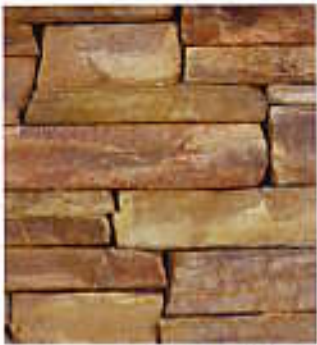
CAMBRIA | Cliffstone