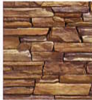
SEQUOIA | Rustic Ledge