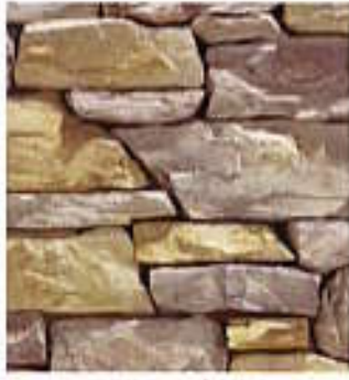
CHESAPEAKE | Shadow Rock