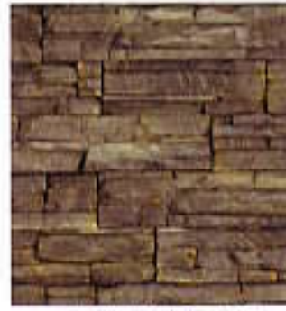
CHAPEL HILL | Stacked Stone