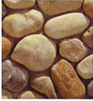
COLORADO | River Rock