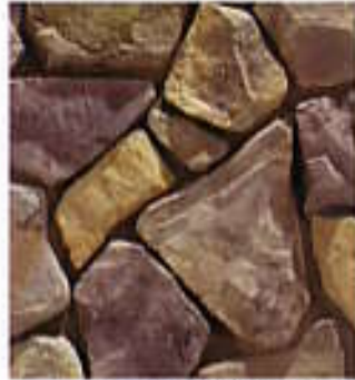
CAPRI | Country Rubble