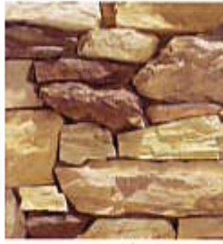
SHENANDOAH | Shadow Rock