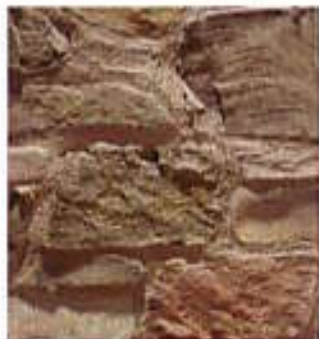
MESETA | Field Ledge