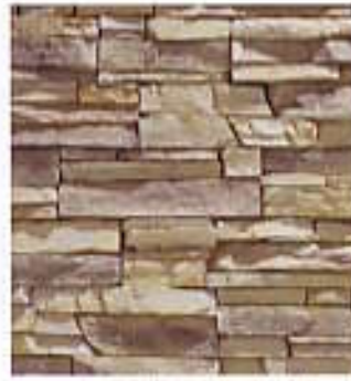
ALDERWOOD | Stacked Stone