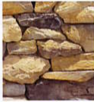
SOMERSET | Shadow Rock