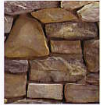
VERONA | Hillstone