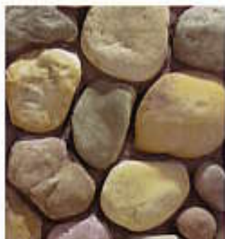
SAGINAW | River Rock