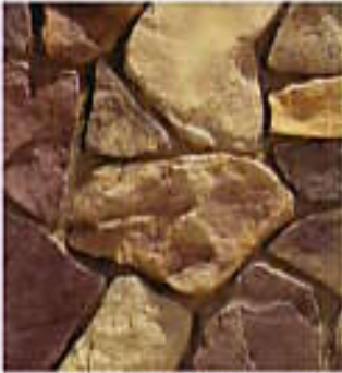
COGNAC | Country Rubble