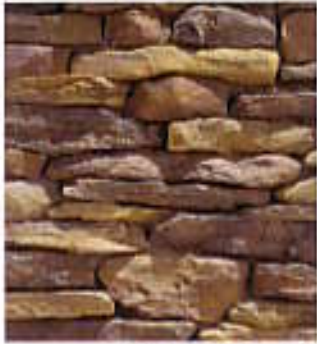
DOGEQA | Bluffstone