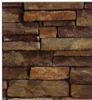
MESA VERDE | Mountain Ledge