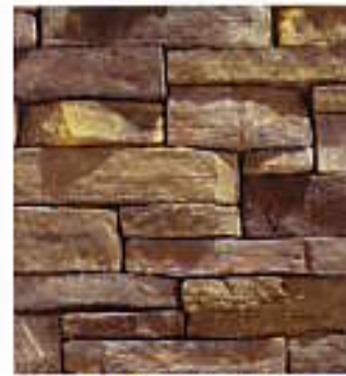
SIERRA | Mountain Ledge

Because Eldorado Stone replicates natural stone, variations should and can be expected. Though colors in this brochure are as close to the actual stone as possible, photographic and printing techniques — and actual viewing conditions — can alter perception of color.