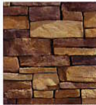
DURANGO | Mountain Ledge