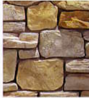
BERGAMO | Hillstone