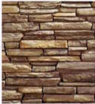
CASCADE | Rustic Ledge