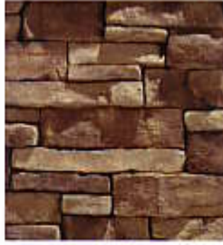
BITTERROOT | Mountain Ledge