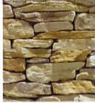
LA PLATA | Bluffstone