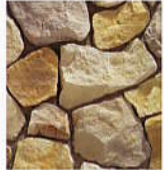
BELLA | Country Rubble