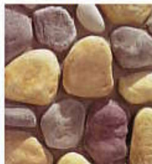
YAKIMA | River Rock